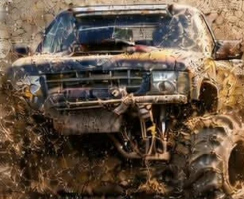
SATURDAY - DAY 3 MUD BOWL 36