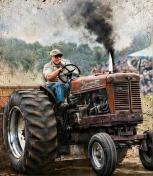
THURSDAY - DAY 1 FARM TRACTOR PULL