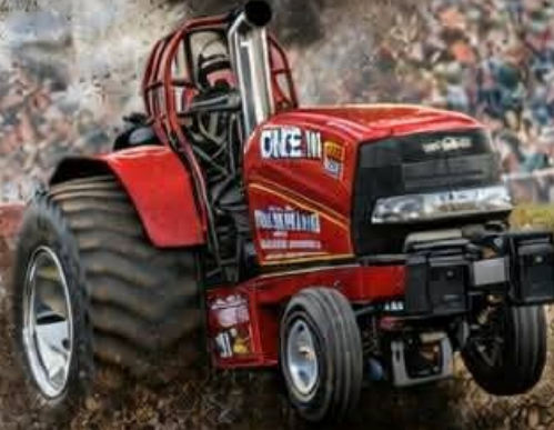
FRIDAY - DAY 2 TRUCK AND TRACTOR PULL